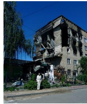
Residents in Bucha. Photographed on June 3, 2022.