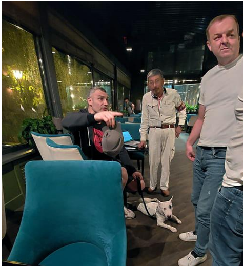
Encountering with Mayor Vitali Klitschko (on left).