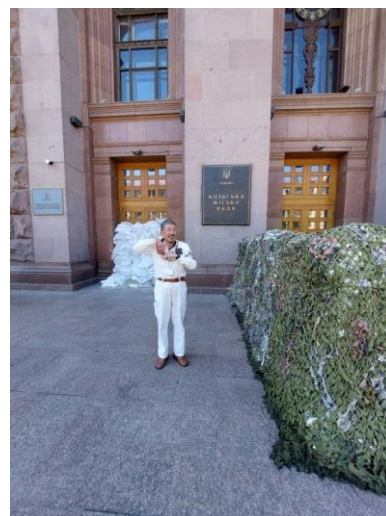
Kyiv Municipal Government Building.