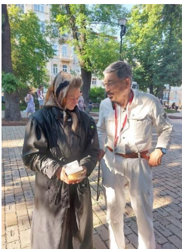
An elderly woman living alone, sleeping on an outside park bench.

The conversation for searching orphans for humanitarian assistance, I could not have done without hearing the memory of occupation of the village by the Russian army. Why did the child's parents have to be killed? How should they accept the unreasonableness of being treated badly even though they have done nothing wrong to Russia? The starting point is communication about how children who have lost their parents can survive.