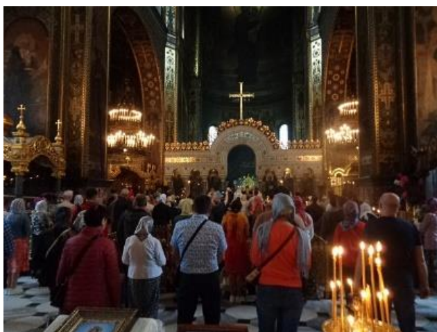
St Volodymyr's Cathedral, Kyiv, which we attended the service. June 5, 2022.