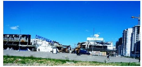
City view of Bucha.