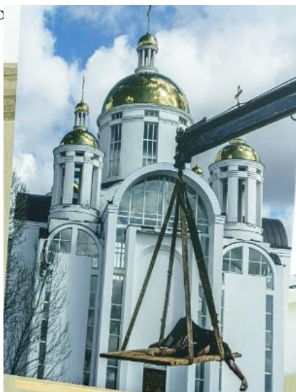
Bucha City. Photographed by local reporter of Vlad frc 1, 2022

Before visiting Ukraine, I talked at my seminar based on paper of France that the Ukrainian army themselves brown off a bridge lead to the capital