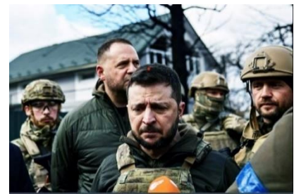
"Buss Feed News" (April 5, 2022)