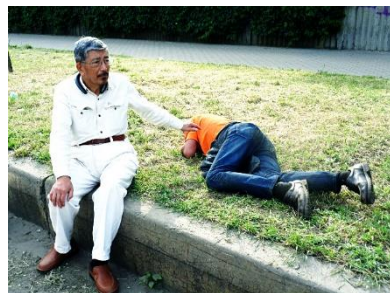
Be with the most "small people" in Kyiv.

The Bible says, ".....show mercy and compassion to one another. Do not oppress the widow or the fatherless, the foreigner or the poor. Do not plot evil against each other 42 ." The only thing that matters is that children are should not oppressed by war, neoliberal inequality, or parental divorce.