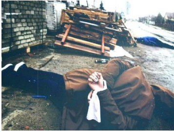
A body with hands tied behind its back and a shot through the back of the head.