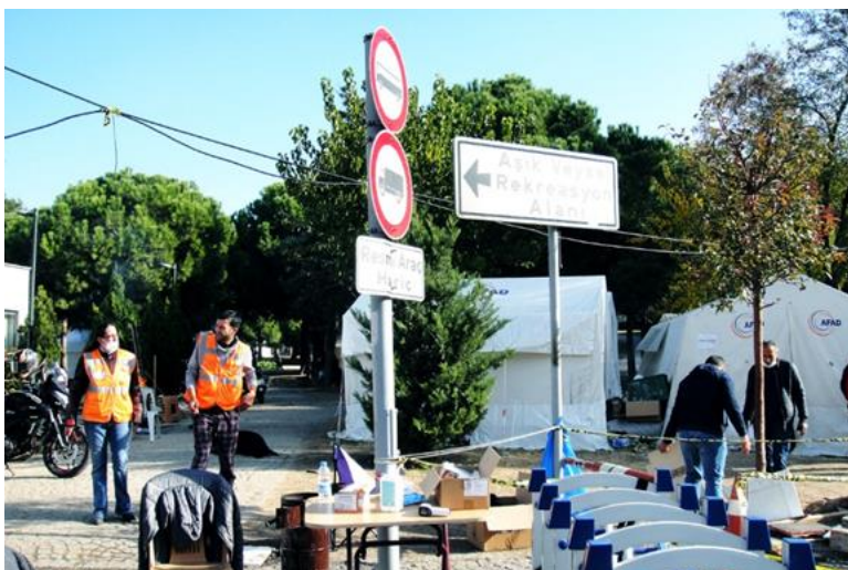
Aşık Veysel Evacuation Center. November 24, 2020.

On the morning of November 24, we started to go out after having a quick breakfast with bread, yogurt, tomatoes, olives, and tea. By walking for about 45 minutes, we reached the evacuation center for those who lost their homes by the earthquake. We asked if there are any orphans.