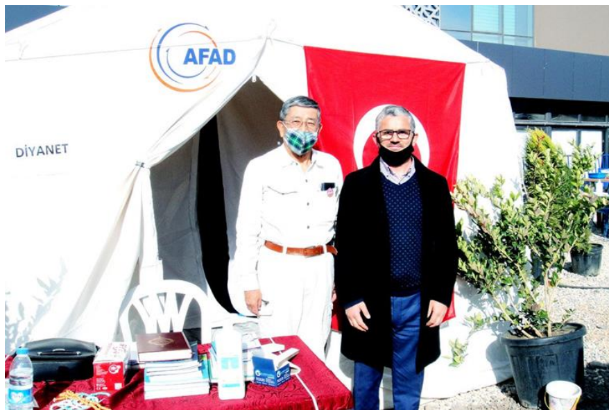
Islamic priests providing spiritual care at Evacuation Center. November 24, 2020.

The care for people's hearts who lost their home, family, and work, was lean to religious people not to specialists. For "cure (treatment)", doctors were stationed at the evacuation center.