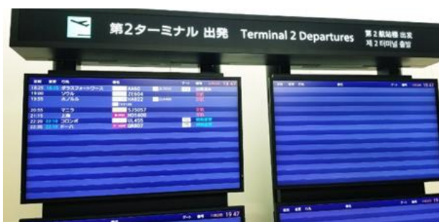
Terminal 2, Narita International Airport. November 22, 2020.

There was no flight from Kansai to Narita Airport. We needed to reserve flights directly with airlines in Doha and Istanbul. We were not sure whether overseas flights from Narita Airport were available. We went to Narita by train from Haneda Airport, but we didn't see anyone look like an overseas traveler from the window. We were not sure whether flights are operating or not, but we just did it on the spot. The airport was very quiet like a ghost town and few people at duty-free shops and the boarding counter.