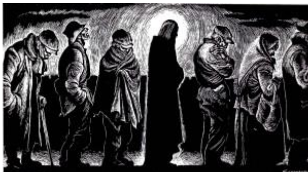
“Christ in the Breadline” Fritz Eichenberg [1901-1990]. Print.

What is the manifestation of the gospel? The Bible is consistent.