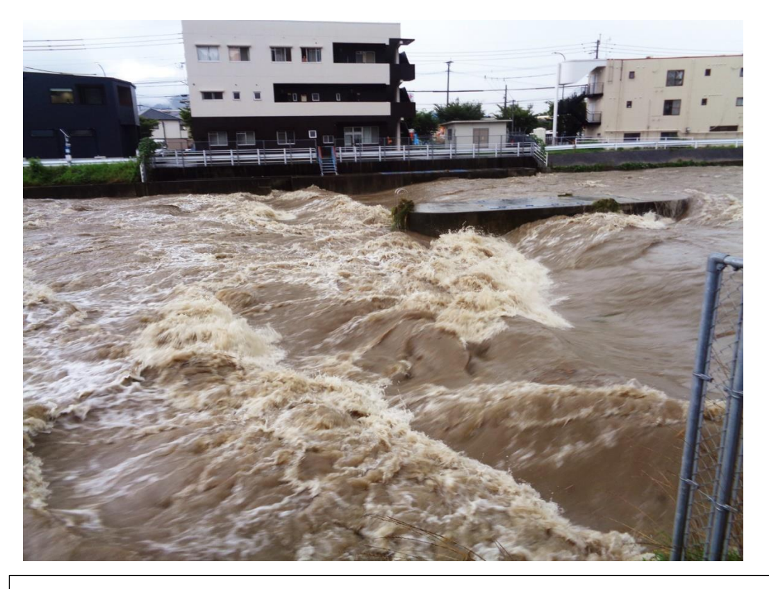
Rising waters of the Umi River in Shime Town, Kasuya District, Fukuoka Prefecture. July 10th at 8am.

An eviction warning kept going in Shime-machi. On that day, I recorded the release of water from Terauchi dam (Asakura City Fukuoka Prefecture), which was the cause of the muddy water that swallowed residences in Kurume City. The thundering sound of dam was releasing the same amount of inflowing of rain.