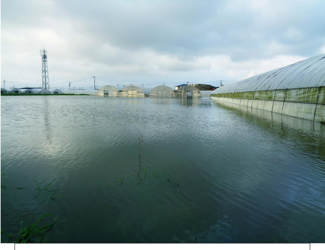
Kitano-cho, Kurume City, Fukuoka Prefecture July 10, 2023 3:00 pm

There was nothing but muddy water. plastic greenhouses at Ishizaki Kitanomachi Kurume City are sunken by water<sup>1</sup>. There are several cars run through the road by making a big water splash, that is reckless act. Many of them are stuck in water. They are trying hard to get out of it, so no car tends to stop. I cannot tell what I see whether rice fields, sea nor rivers. Chikugo River is over flooded.