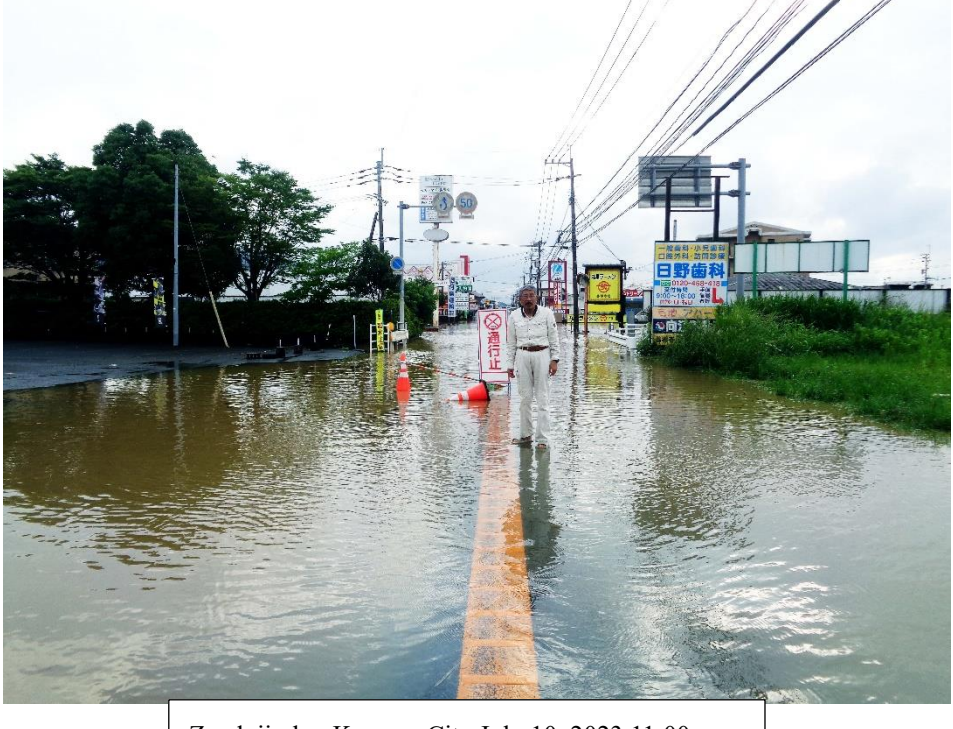
Zendoji-cho, Kurume City July 10, 2023 11:00 a.m.

Isn't it too soon to conclude that the floods in early July every year are related to El Niño weather, global warming, linear rain belts, etc.? As our modern human society pursues economic globalization, "water" help to operate large factories and "electricity" bring us a convenient life. We must wake up to see the fact that dams are the root of all the evils of housing public development by nuclear families that would damage the ecology of mountains. After noon on July 10, Zendoji-cho Kurume City was isolated. Roads were flooded and cars were stacked. Many of the people were puzzled and said that the flood was which "they never have experienced".