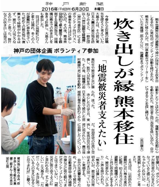
"Kobe Shimbun" (June 30, 2016).