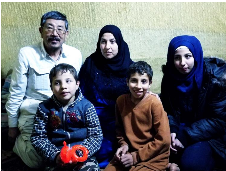
December 28, 2017 Escaped refugees from Raqqqa Malish

In 2017, the civilian journalist group “RBSS (Raqqqa is Being Slaughtered Silently)” was driven out from Raqqqa in Syria where was the home of “Islamic State”. The number of death reached 3,259 people. Among this, the victims by “Islamic State” are only 548 people. The remaining 63% are victims by the United States military bombings.