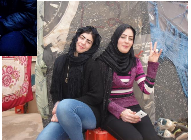
February 8, 2018 Refugees from Raqqqa, Aarsal

United States Army general Herbert Raymond McMaster, Assistant to the President for National Security Affairs, said “The United States government has been thinking that we can solve the war by using the technology that learned through Vietnam, Afghan and Iraq war, but it was a mistake. The war has been