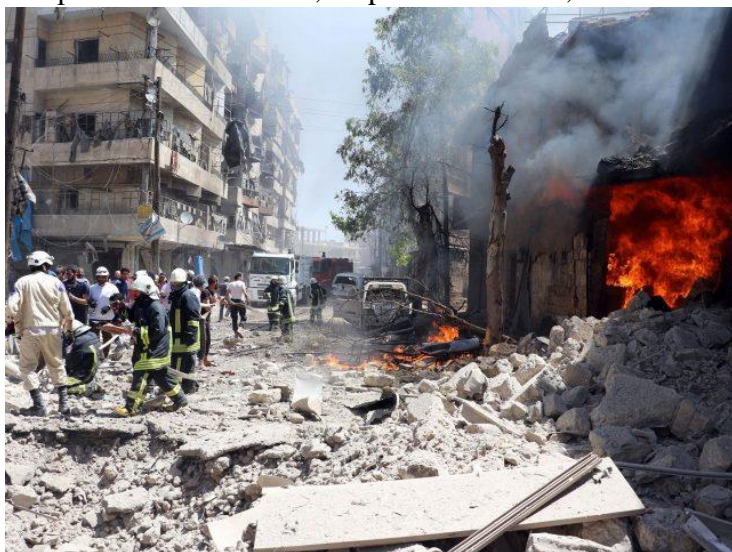
The devastation in Aleppo, the second main city in Syria.

Aleppo in Syria was completely destroyed by air bombings. That is the place where we were going to build an orphan's house. Schools, hospitals and houses, all became ruins and rubble.