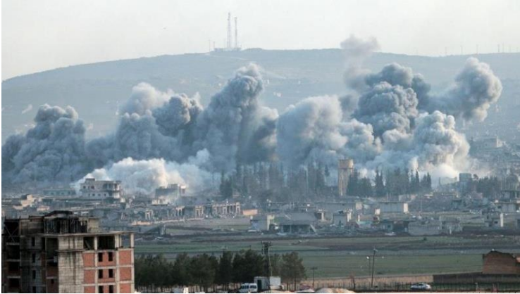
Raqqa attack by the United States military on August 21, 2017

In 2017, the civilian journalist group “RBSS (Raqqqa is Being Slaughtered Silently)” was driven out from Raqqqa in Syria where was the home of “Islamic State”. The number of death reached 3,259 people. Among this, the victims by “Islamic State” are only 548 people. The remaining 63% are victims by the United States military bombings.