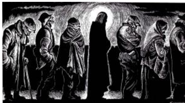
“Christ in the Breadline” Fritz Eichenberg [1901-1990]. Print.

What is the manifestation of the gospel? The Bible is consistent.